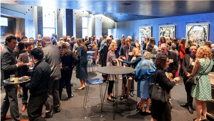
Guests enjoy the reception at the 2023 ArtsFairfax Awards.

Website (March 2023 - March 2024 via Google Analytics 4); Facebook and Instagram (March 2023 - March 2024); Twitter (March 2024); and Email (March 2023 - March 2024).