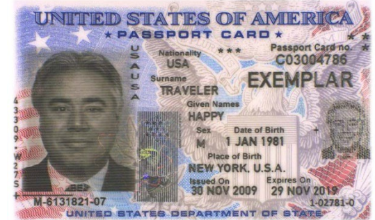
Passport Card Sample