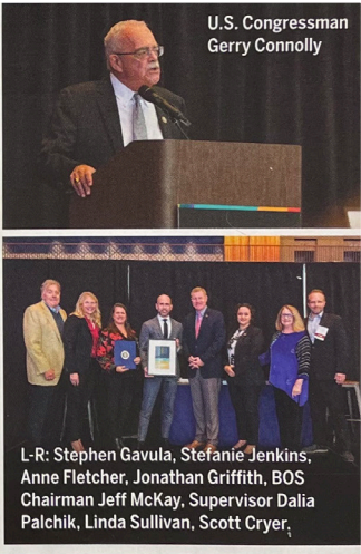
ArtsFairfax Awards coverage in the April 2023 issue of Virginia Living .