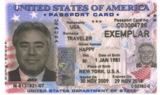
Passport Card Sample